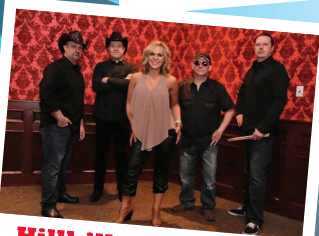
Hillbilly Rockstarz Friday, August 14