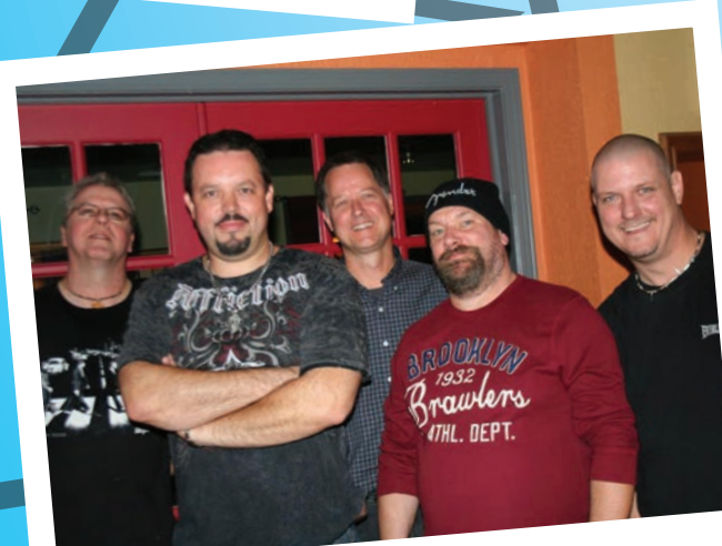
Under D influence Saturday, August 15