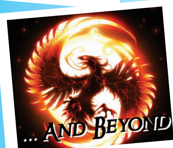
And Beyond Thursday, August 13