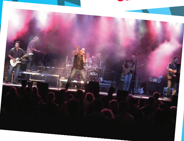
ARRA Saturday, August 15