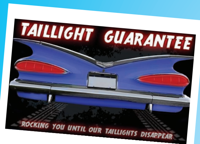
Taillight Guarantee Wednesday, August 12

Central Park Route 6 at Bluff Road, Channahon